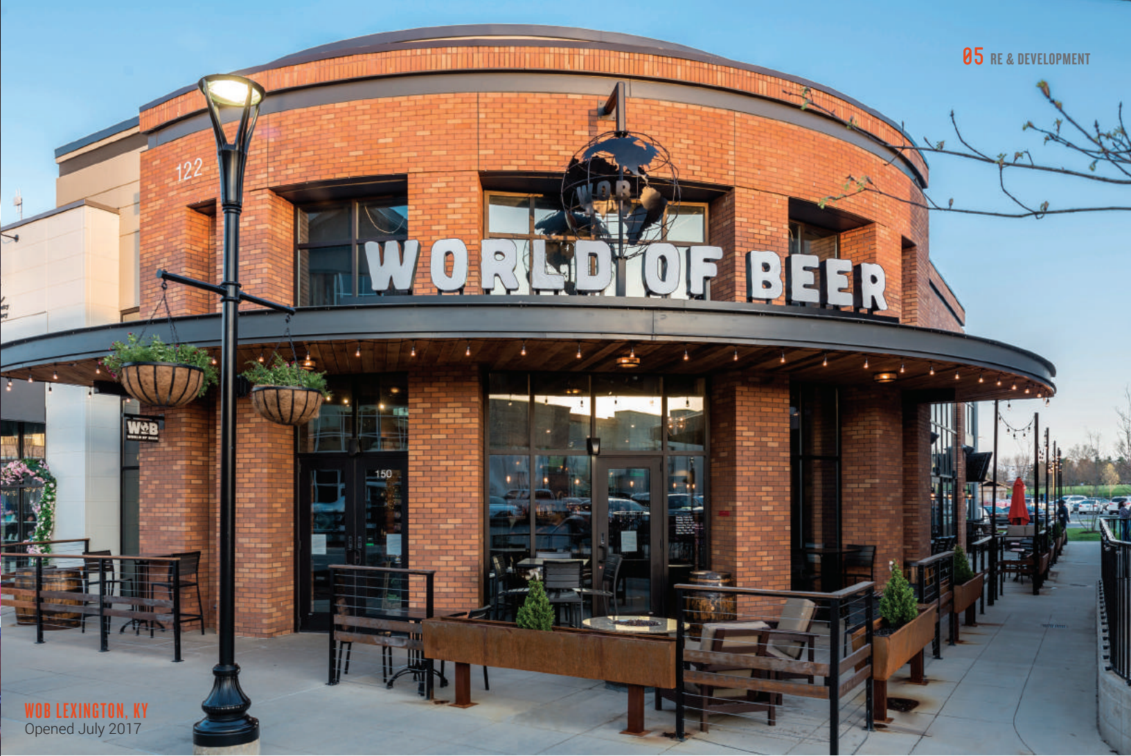
WOB LEXINGTON, KY Opened July 2017